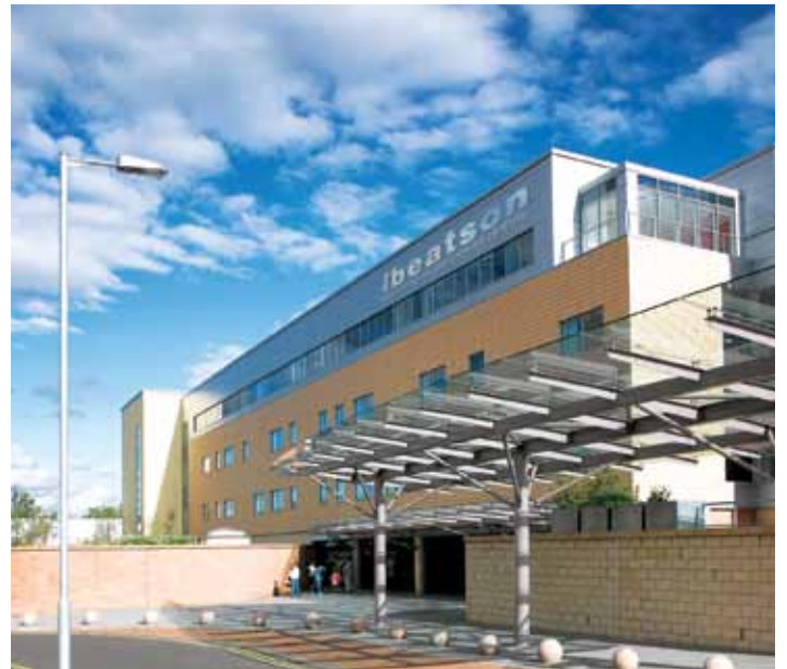
Above: The Beatson West of Scotland Centre

Crucially, for the integrity of records and communications regarding patient treatment, better quality sound through digital recording reduces transcription errors.